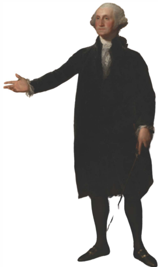
George Washington by Gilbert Stuart

Learn more about Washington and his legacies by exploring the following sources.