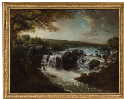
Great Falls of the Potomac