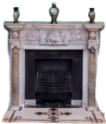
The New Room

Use these primary sources to learn more about the New Room and Washington's vision. Then, use the template on the following page to design your own fireplace mantle.