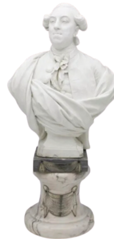
Jacques Necker Bust