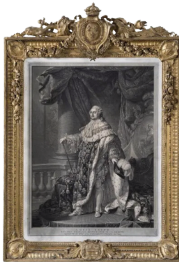
Louis XVI Engraving