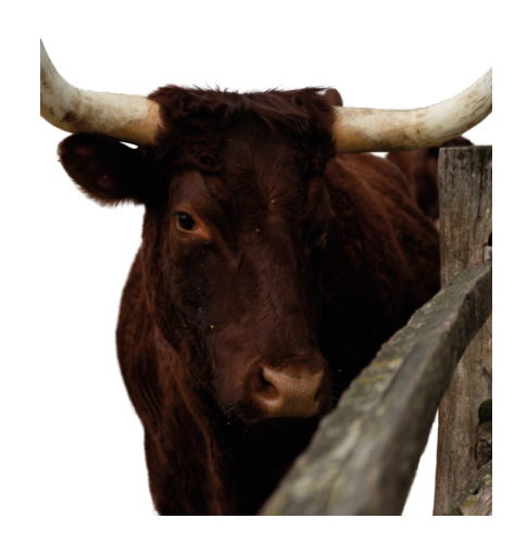
Animals at Mount Vernon