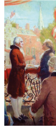
WASHINGTON AS PRESIDENT