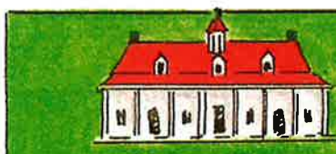
MOUNT VERNON Start