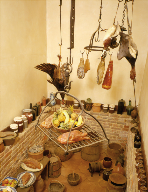
This is an example of how food could be stored in the kitchen at Mount Vernon.

Hint: If you can't find an answer, be sure to ask a member of the Mount Vernon staff!